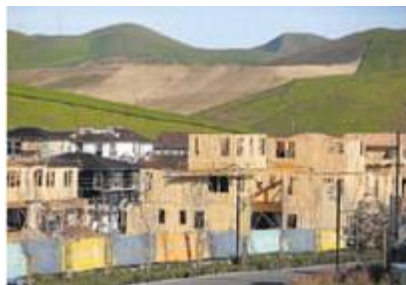
New homes in the Wallis Ranch development sit in the mostly unbuilt Tassajara Valley region of Dublin.

Contra Costa, Sonoma and Santa Clara counties have the most land potentially facing bulldozers, said the Greenbelt Alliance, a San Francisco-based environmental group that conducts the most comprehensive survey of development patterns in the Bay Area every five years.