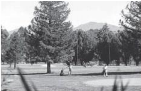
Golfers walk the course on the last day of operation at Pine Meadow Golf Course in Martinez in 2015.

The property owners insisted on receipt of an official written resolution at that time, so the meeting continued on until the city attorney could write one.